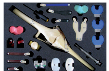
Recon knee model

SYNBONE maintains a consistent record of on-time delivery to our global customer base. Over the past few years, our records show a 99.4% on-time delivery record. Additionally we offer specific online tools which help our customers to plan courses and other logistic activities.