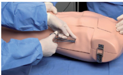
SYNMAN torso model