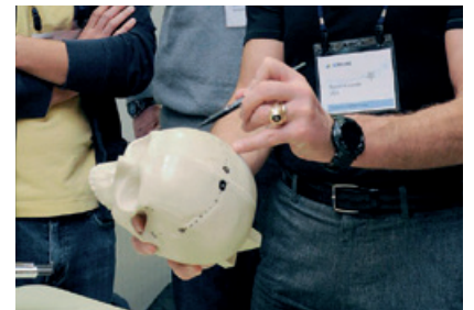
SYNBONE + Customers = Winning combination