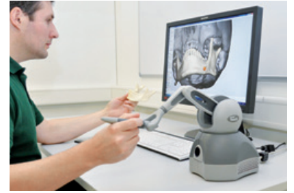
3D Design Engineer

We combine our skilled methods with specialized production partners at both SYNBONE locations in Switzerland and Malaysia. These actions keep the quality high and production costs low, resulting in highly competitive product prices for our customers.